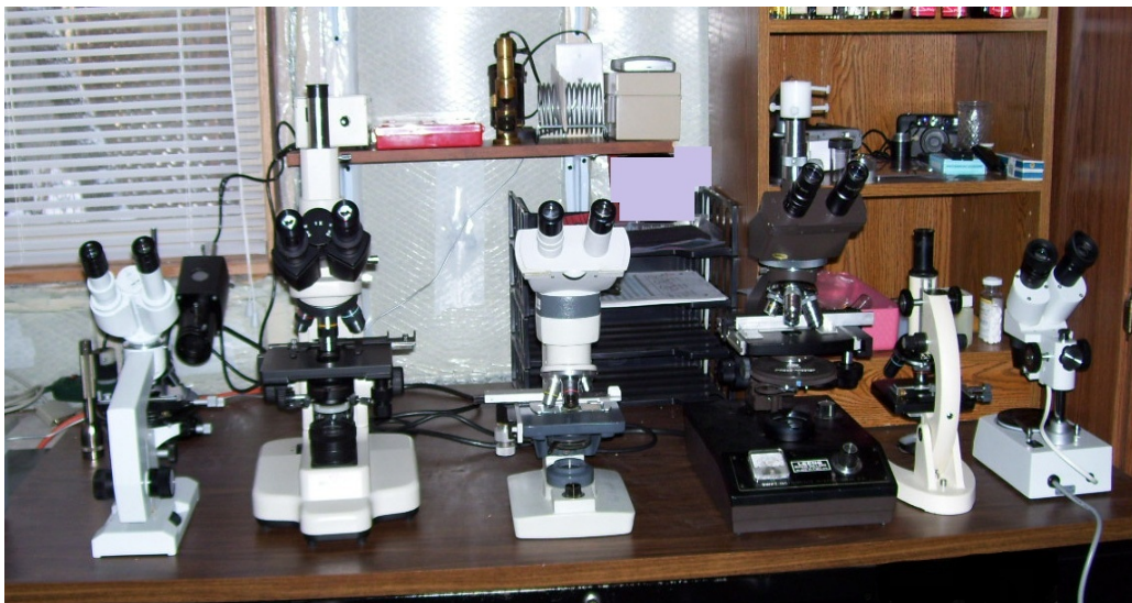
Some of my toys