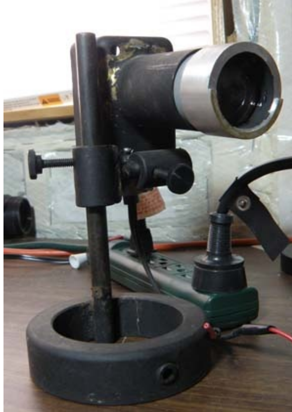
Automotive bulb and a lens from Edmund Scientific.

Then I built my own Köhler lamp which gave me excellent visual images, but it was hard to set up and a pain when changing power.