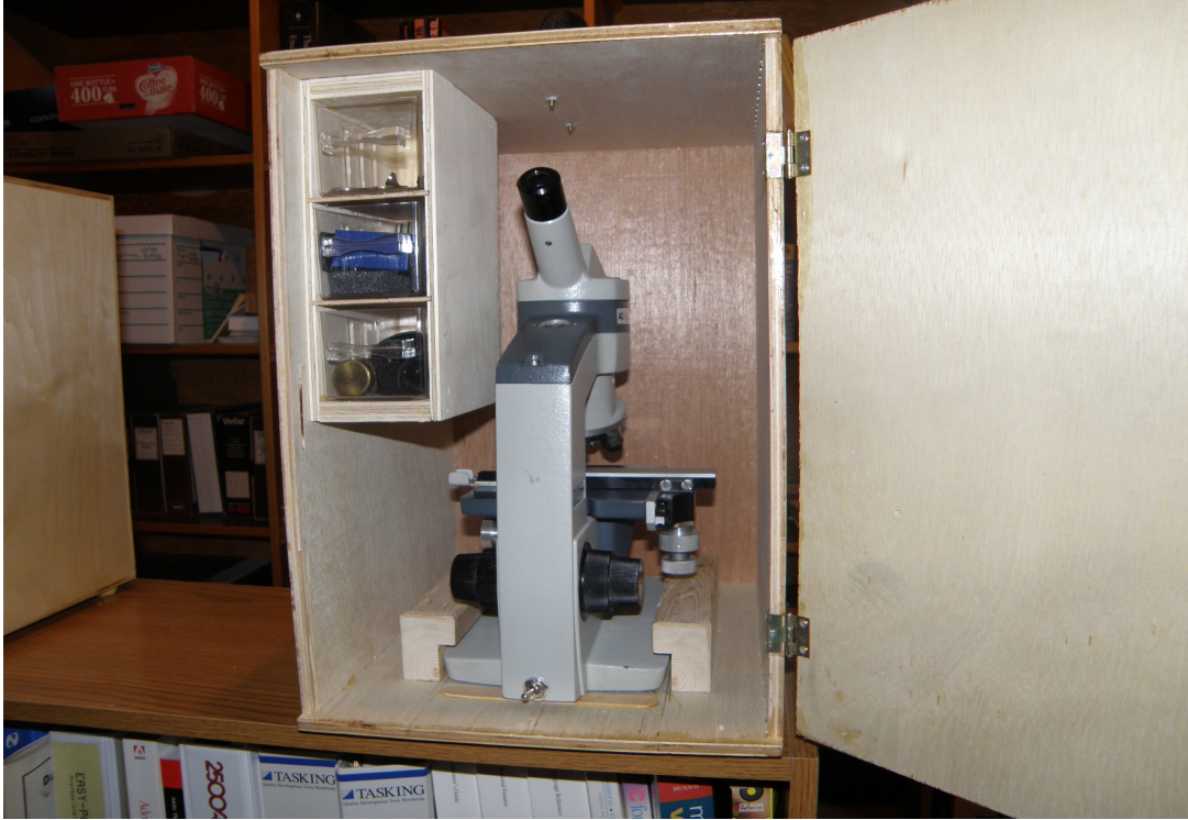
My travel companion 4X, 10X, 20X and 40X objectives. Changed to monocular to lower the weight.