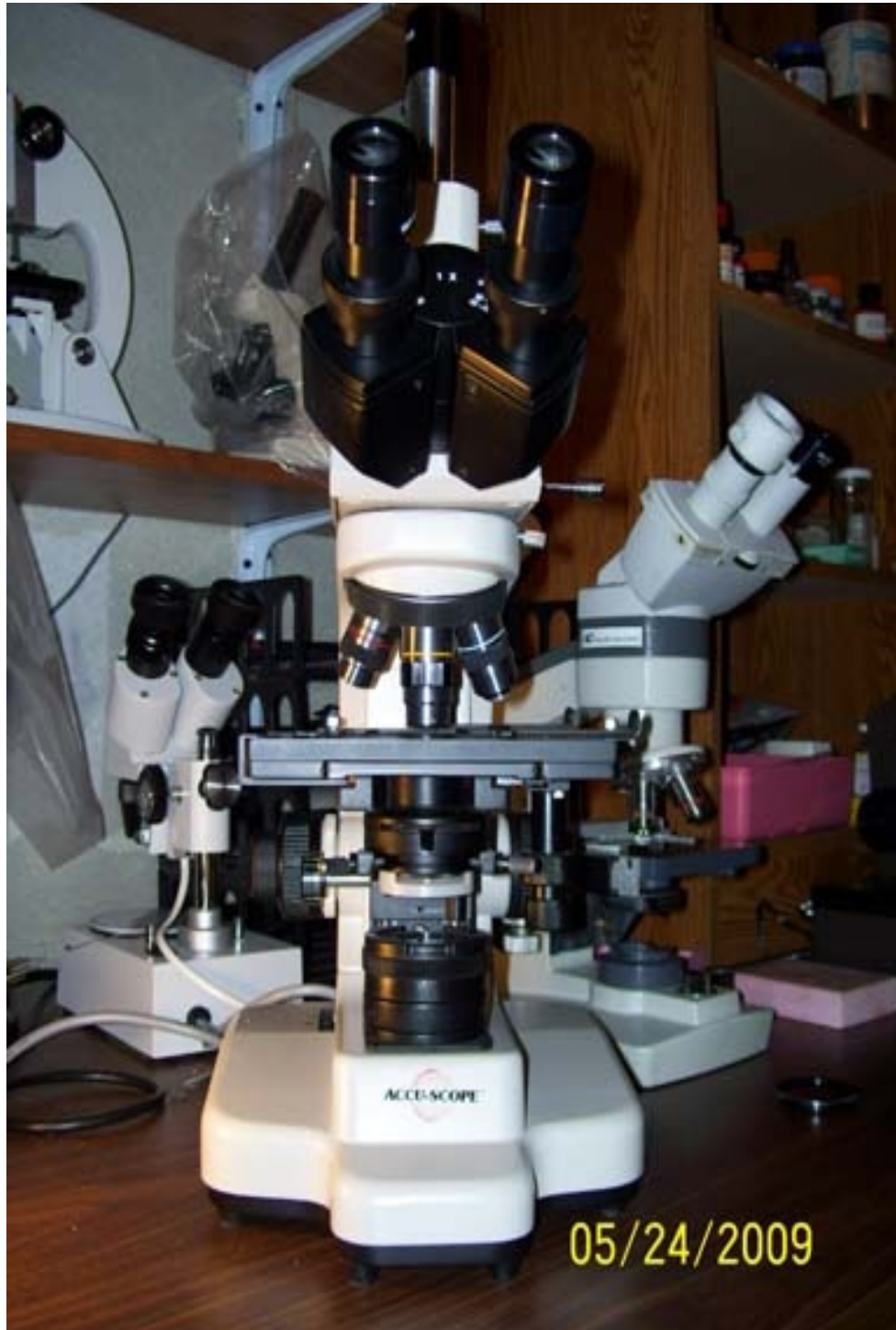
Accuscope, trinocular, easy to use, easy on the eye.

You can now buy brand new trinocular microscopes for less than $300. Reviews on these are good enough to make them seem acceptable. I paid over $1000 for the instrument below. The optical and mechanical quality is very good.