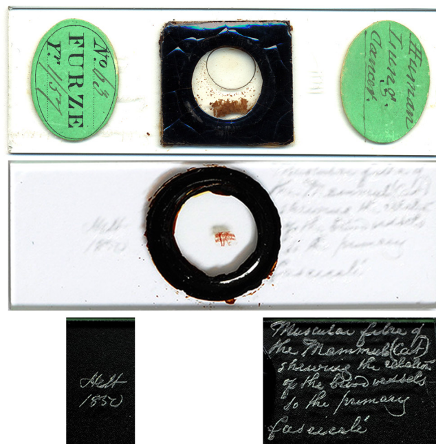
Figure 2. Two unusual Hett slides. The upper slide used a thin (approximately 1mm thick) cell, and the specimen was not injected with dye. This slide was once owned by fellow Microscopical Society of London member, John Furze, who attached his own, characteristic labels. The lower slide is an injected preparation of cat muscle, mounted in what appears to be balsam (not a fluid mount). Also rather unique, Hett dated this slide, 1850.