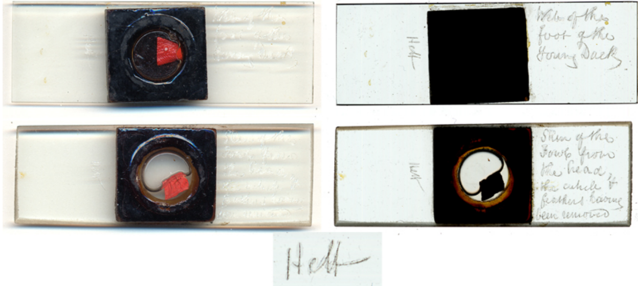
Figure 1. Two examples of typical microscope slides prepared by Alexander Hett, scanned using both reflective light (left) and transmitted light (right). Each holds a thick section of animal tissue, injected with a red dye, and held in a deep, fluid-filled cell made of dark glass. Upon the slide, Hett etched his name and a description of the specimen. A magnified view of Hett's signature is shown below the slides.

Alexander Hett's microscope slides were highly regarded in his day. His preparations were of human and other animal tissues, generally injected with bright red pigment, in fluid-filled cells. He is known to have been a commercial slide preparer by the late 1840s, and was still active in the trade at the time of the 1862 London Exposition. Today, Hett's slides are sought after by collectors, and often command high prices.