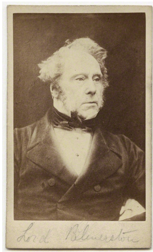
Figure 3. A further argument against “H.W.” having been Herbert Watkins: the famed photograph of Lord Palmerston taken by Watkins in 1857. It is impossible to believe that Watkins would have made a microphotograph using a picture by John Mayall instead of his own production.