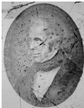
Figure 2. Lord Palmerston, photograph number 31. The Prime Minister was noted by 'Blackwood's Lady's Magazine and Gazette of the Fashionable World' as being a subject of microphotographic slides made by Henry West. The original photograph was taken by J.J.E. Mayall. J.B. Dancer's microphotograph number 74 was produced from the same Mayall photograph, although Dancer's image shows all of Palmerston's body. This picture is distinct from the famous photograph of Lord Palmerston issued by Herbert Watkins (Figure 3).