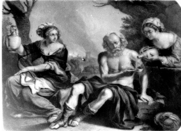
Figure 1. Microphotograph number 6, "Lot and His Daughters". The label on the right describes Henry West as being a "microscopic photographist". Further connecting West to this slide, the 1858 'Blackwood's Lady's Magazine and Gazette of the Fashionable World' stressed that West produced microphotographs of paintings from the Dresden Gallery.