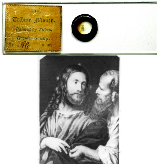
Figure 4. Microphotograph number 8, “The Tribute Money” by Titian, from a painting in the Dresden Gallery.