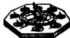
Figure 8. From the 1860 'Official General Guide to the Crystal Palace and Park'.

A SUNDIAL, like this, is placed on the Terrace of the Crystal Palace; it shows the time at eight different parts of the world at one sight, and also at the spot where it is placed. Made by H. WEST, Optician and Sundial maker to the Queen, 41, Strand, opposite the Lowther Arcade.