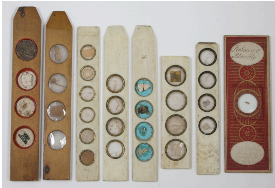
Figure 3. Examples of ivory and wood slides, which Griffith described as being out of fashion in 1843. A circa 1860s 1x3 inch slide by Charles Topping is shown for size comparison.

Transparent Objects. - Different methods from those usually adopted were formerly made use of to prepare these. They were laid upon slides of various kinds, ivory, wood, or glass. The ivory ones (which are scarcely ever now used), of various sizes, had circular apertures turned in them at regular distances; in these holes small discs of talc were laid; they were prevented from falling through these holes by an elevated rim left at one end, so that the aperture was larger at one end than at the other; on the other side they were prevented from escaping by the pressure of a small brass ring (cut from off a spiral coil). These, as I have said, are now rarely used, on account of the expense of the turned ivory, the difficulty in arranging the objects nicely, as well as the obvious objections to the talc. The wooden ones are abandoned for nearly the same reasons.