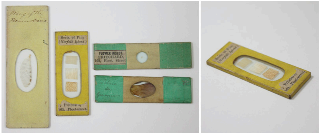
Figure 4. Examples of “transparent objects dry ... laid between two ... slips, ... and the whole slide covered with a doubled piece of pasted coloured paper, excepting two circular or other shaped apertures corresponding to the site of the objects”. The left panel shows a standard sized (1x3 inch) slide that was probably made by C.M. Topping, sections of pine wood retailed by Andrew Pritchard (maker unknown) and two slides made by Joseph Bourgoigne (one of which was retailed by Pritchard).