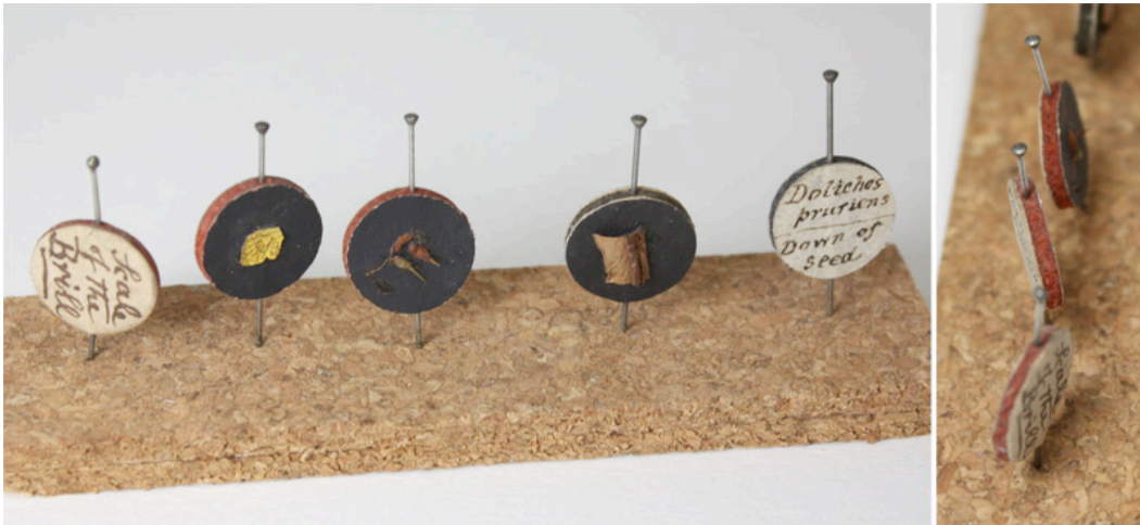
Figure 1. Examples of opaque specimens “fastened upon circular discs ... then transfixed with fine pins”. A description of each specimen is written on the reverse. The discs are approximately 1/2 inch / 1 cm in diameter.

A. The dry ones are usually fastened upon circular discs, or columns of cork, by a little gum, or solution of gum mixed with isinglass; they are then transfixed with fine pins, so as to be stuck into cork, which forms the bottom of the drawer in which they are arranged. Sometimes the circular flat discs of cork are fastened upon glass slips, and arranged in cabinets in the same manner as transparent objects. The cork must always be blackened, so as to prevent the reflection of any luminous rays which might interfere with the distinct vision of the object. This is effected in cork either by scorching or painting it over with an intimate mixture of finely powdered lamp-black and gum-water. But almost any black surfaces may be used for this purpose—black velvet, silk, paper, or blackened metal. When the opake object is illuminated (and which is the best way) by the condensation of light by a plano-convex or other lens, the size of the cork or other support for the object is of no consequence. But when the light is first reflected by the mirror and subsequently condensed by a second concave metallic mirror or cup, of course the smaller the object-holder is, the better, because it allows a larger number of rays to be condensed and to illuminate the object more perfectly.