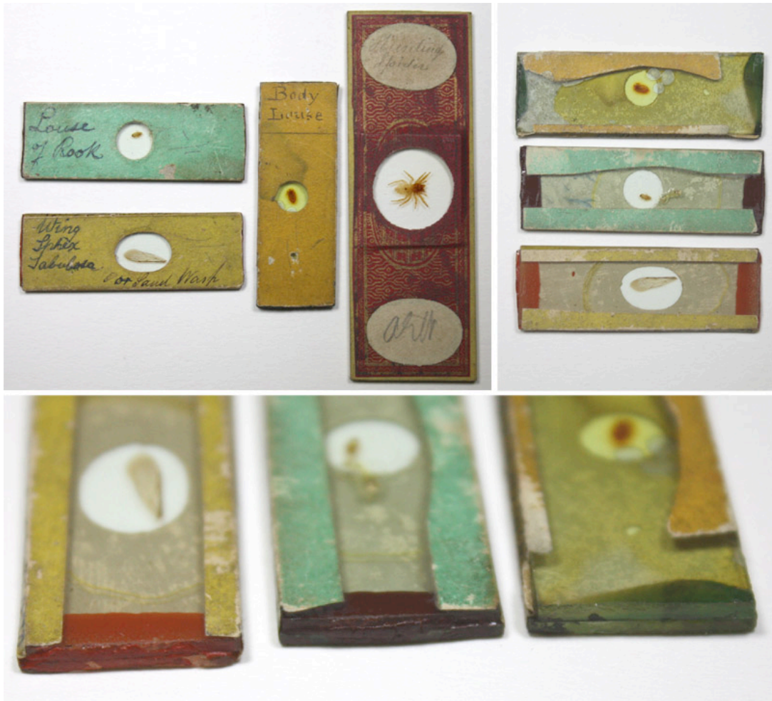
Figure 5. Three examples of specimens “immersed in Canada balsam .. (between) two glass slips”. Griffith recommended that, “In many cases it is convenient to fasten the two ends of the glass slips together whilst the balsam is solidifying, so as to insure the avoidance of displacement: this can be done by a little sealing-wax”. The three illustrated slides were similarly secured with two shades of red wax and one of green (upper right and the lower panel). A ca. 1870s standard sized (1x3 inch) slide made by Amos Topping is shown in the upper left panel as a size comparison. The ca. 1843 slides measure approximately 2 x 1/2 inch.

A large number of the most beautiful and delicate objects cannot be preserved in the dry way, the shrivelling and contraction which ensue totally destroying the natural appearance. These are best kept in a small cell containing a liquid, which must be prevented from evaporating. The liquids mostly used are, syrup mixed with gum, dilute spirit, water saturated with creasote, or the fluid invented by Mr. Goadby, and which is the best. It is thus made: take 4 oz. of bay salt, 2 oz. of alum, 4 grs. of corrosive sublimate, and 2 qts. of boiling water; these must be well stirred together, and filtered through fine filtering paper. This is an excellent composition for preserving animal and vegetable substances, and has less action upon them than any of the other fluids. The spirit or water and creasote corrugate the preparations so as in many cases entirely to destroy their characteristic appearances, and the syrup has a powerful exosmotic action, which collapses all vesicular preparations. There are two methods of forming the cells here: in the first a varnish is used to inclose the liquid; in the second a wall is formed to the cell, of glass, &c.