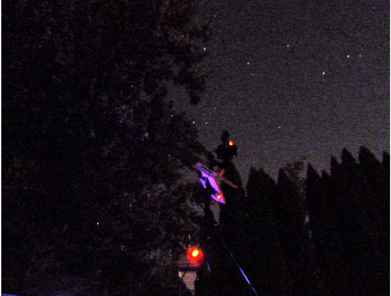
A rudimentary set-up, for an evening of astrophotography.

I recently relocated from an urban area, to a much more rural location. At that time, I was still keen on astrophotography. I was regularly imaging deep sky objects under my urban skies (using low-cost equipment). The overall results did improve under the darker skies.