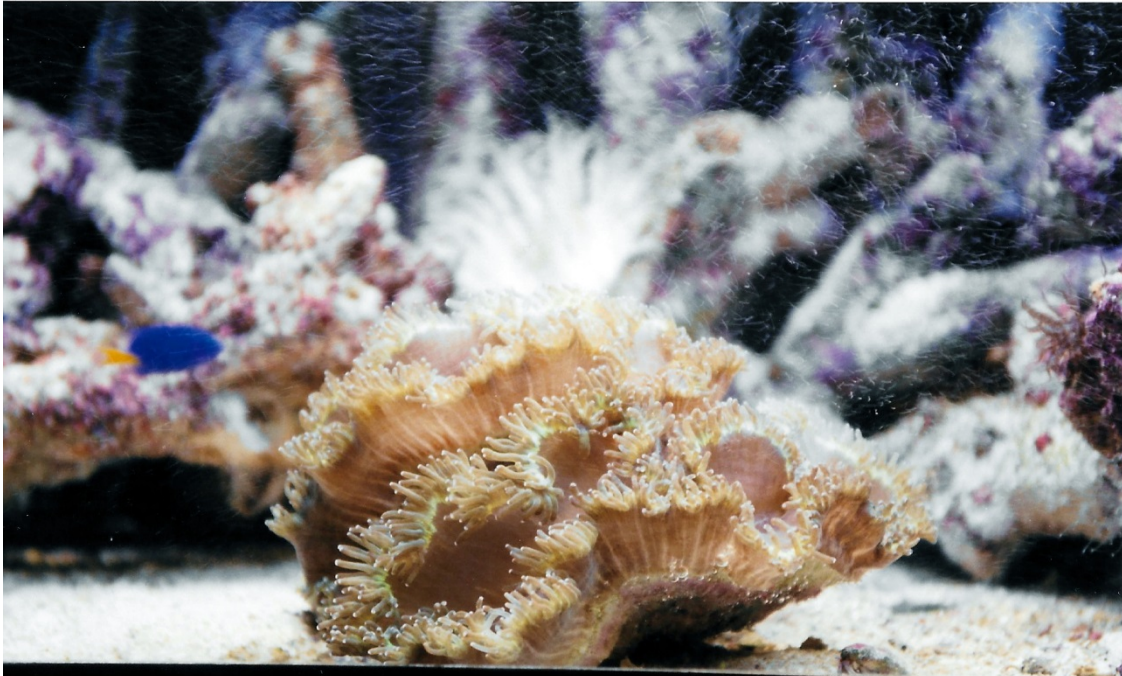
Partial view of a mini-reef aquarium I kept. Elegance coral ( Catalaphyllia jardineis ) front & center.